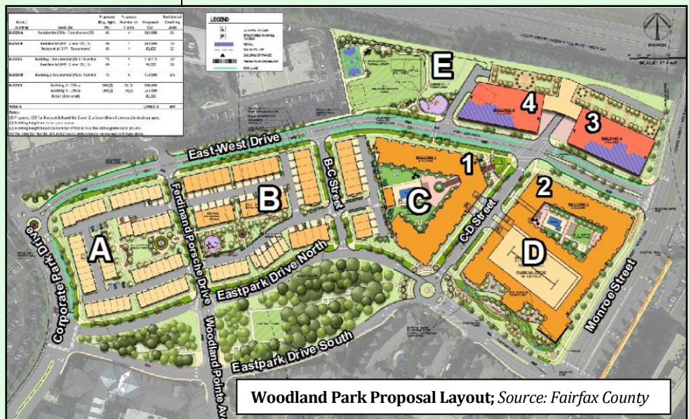
Woodland Park Proposal Layout

The 31.59-acre site, zoned PDC, Planned Development Commercial, is approved for development of five office buildings but property owner Tishman Speyer and